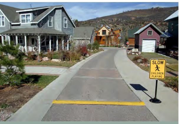
Figure 52—Example of a residential development incorporating a greenway into the design.

According to McInerney's experience, not all greenways and parks are created equal. Longer stretches of greenways, like the Third Creek Greenway, tend to be more desirable to clients than short stretches of separated greenways with on-road sections, and people will often wait for these properties to be listed. McInerney