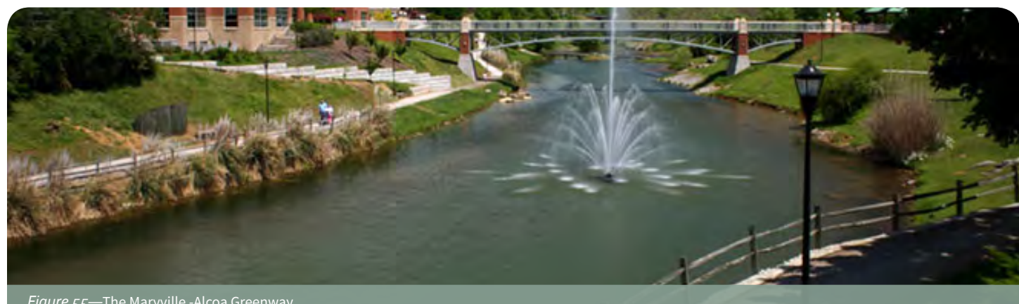
Figure 55— The Maryville -Alcoa Greenway