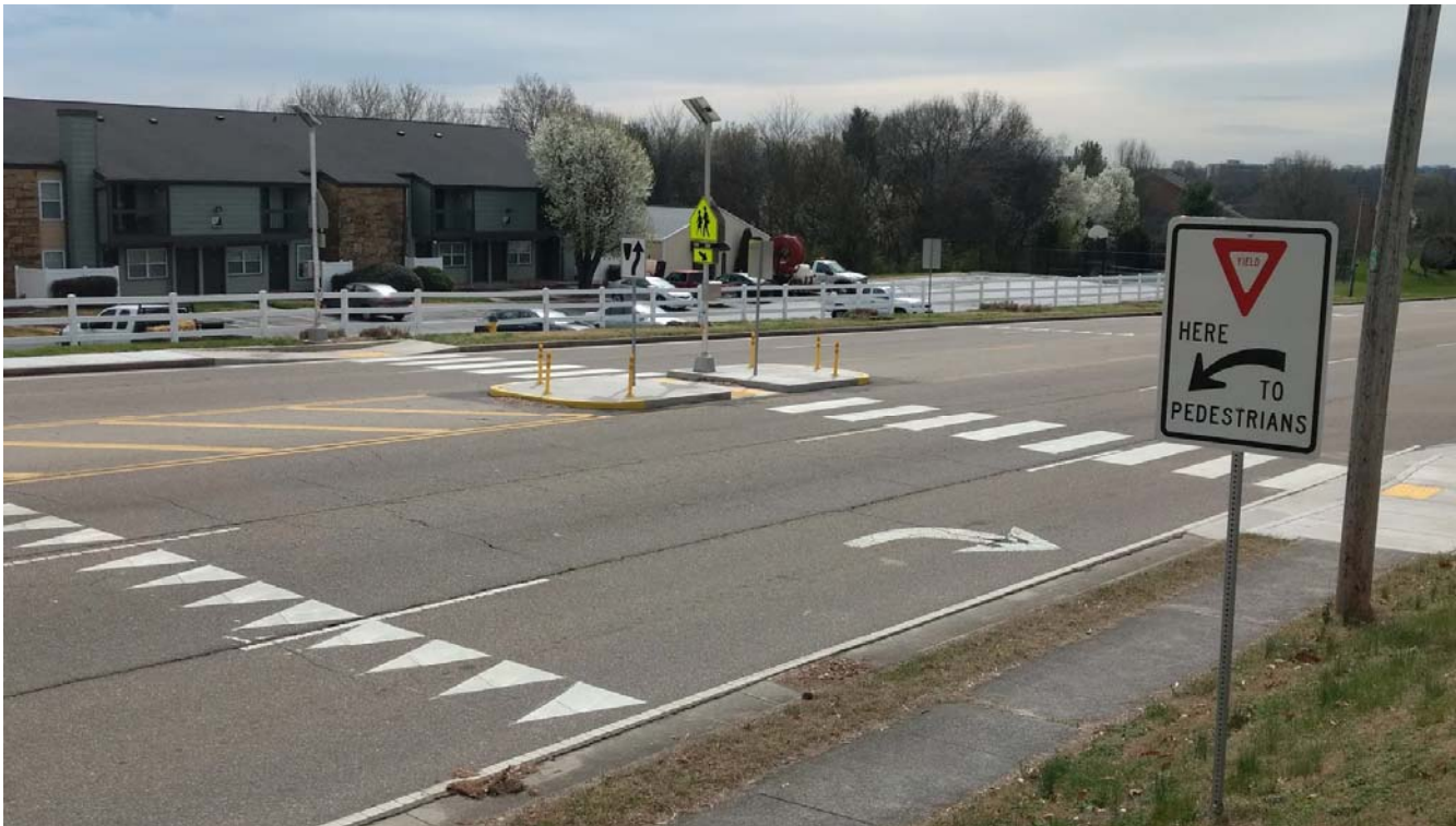
TPO Technical Committee Presentation March 13, 2018